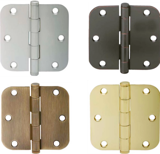
HINGE FINISH OPTIONS

BUYING TIP Make sure you match your lockset finish to your hinge finish.